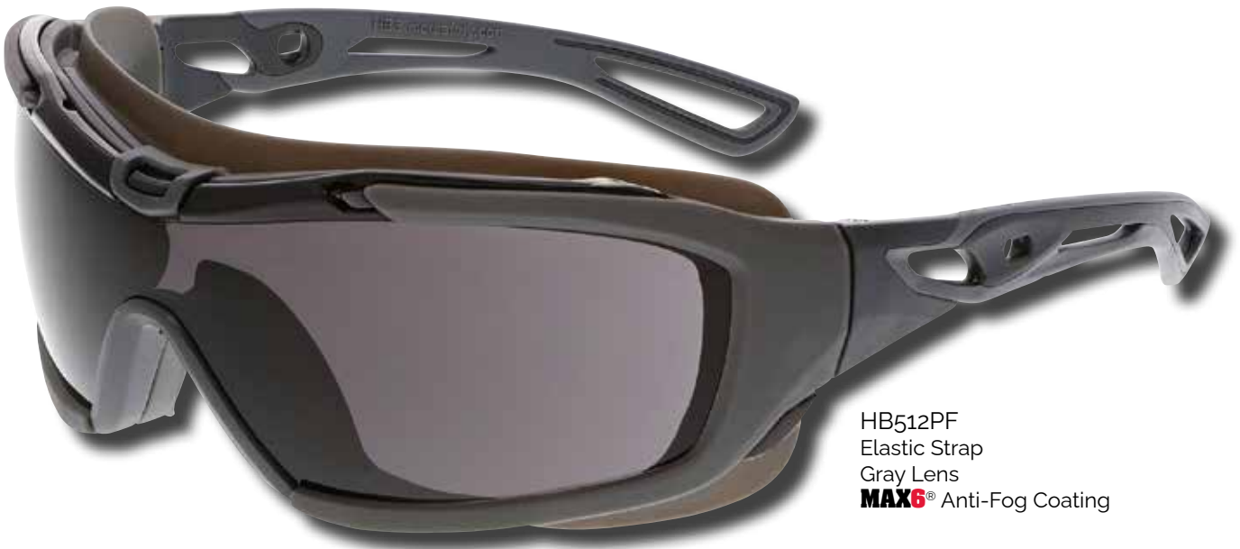
HB512PF Elastic Strap Gray Lens MAX6 ® Anti-Fog Coating