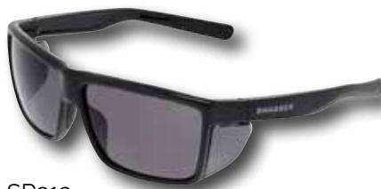
SR212 Gray Lens Duramass® Hard Coat