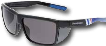
SR232AF Gray Lens UV-AF® Anti-Fog Coating