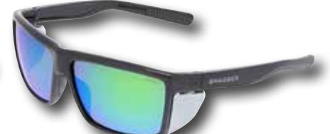
SR22BG Green Mirror Lens Duramass® Hard Coat