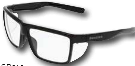
SR210 Clear Lens Duramass® Hard Coat