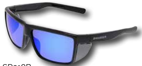
SR218B Blue Mirror Lens Duramass® Hard Coat