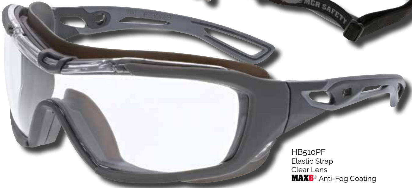
HB510PF Elastic Strap Clear Lens MAX6 ® Anti-Fog Coating